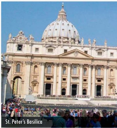
St. Peter's Basilica

Rome - Morning arrival. You will be met at the Airport and transferred to your hotel. The rooms might not be available at the time of your check-in. Eventually a courtesy room will be arranged. In the afternoon, first guided tour of the city, including the Colosseum, the Forum, and the Mamertine Prison and, with a supplement, a Catacomb. Return to the hotel. Get acquainted dinner. Accommodation.